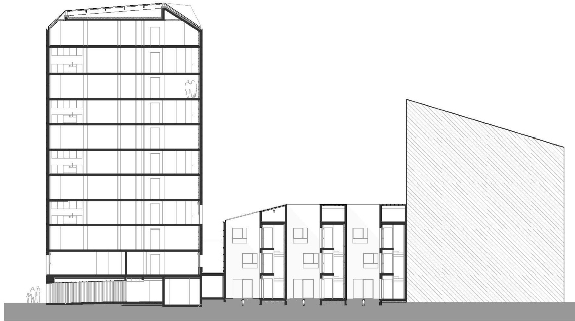
COUPE TRANSVERSALE 0 5 10